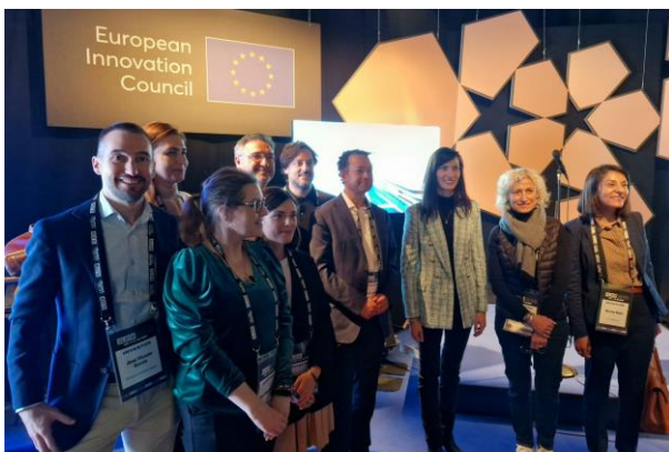
EIC at Slush (Helsinki)

Participation at major international events: The EIC was present at major innovation and deep-tech related events, including VivaTech in Paris (15 June) where EIC sponsored the Next Unicorn Awards; Sifted in London (5-6 October) where the EIC Fund was introduced to the vibrant London deep-tech investor community; Web Summit in Lisbon (1-4 November) and Slush in Helsinki (16-17 November) where EIC partnered with EIB to have a more ambitious presence including a large stand to host workshops.