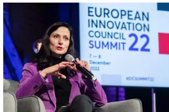
EIC Summit: Photo Credit ©European Union

EIC Summit: On 7-8 December, the EIC held its flagship one-and-a-half-day event in Brussels, organised by EISMEA. Combining plenary sessions, award ceremonies and workshops, the event included 90 speakers and attracted almost 1200 participants. In the EIC exhibition area, 20 EIC-funded projects presented their innovative services and products. The event saw the adoption of the EIC Work Programme 2023 , the presentation of the EIC impact report 2022 , and the nomination of new EIC Ambassadors .